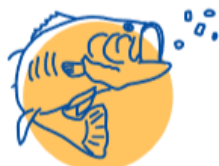
Food, water & nutrients