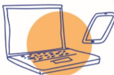
Electronics and ICT