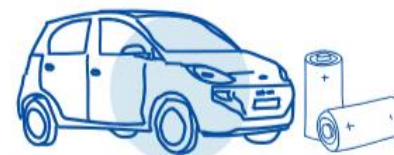
Batteries & vehicles