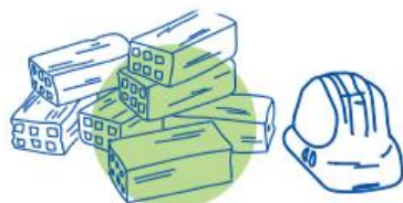
Construction & buildings